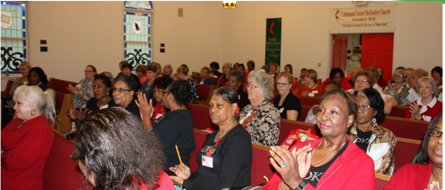
84 DKG sisters from Delaware, District of Columbia, Maryland and Pennsylvania attended the Joint Creative Arts Seminar held at the Centennial United Methodist Church in Smyrna, Delaware. It was a wonderful opportunity for fellowship.