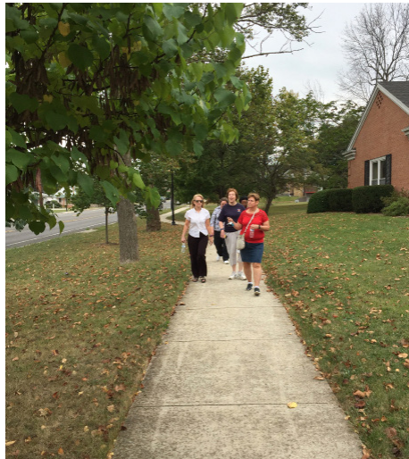
Eta sisters takes a stroll after a business meeting as part of their wellness endeavor.

Following the meeting, sisters changed into their tennis shoes and set out on a two mile leisurely stroll down National Highway. We talked the whole way! Every so often, we paused to change walking partners so that we had the chance to talk to everyone.