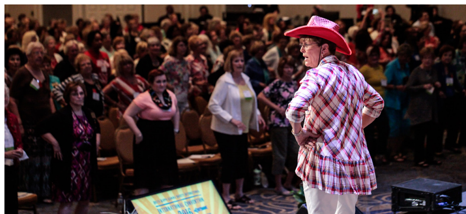
Another rootin' tootin' moment for participants during a Moment for Dance at the Third General Meeting.