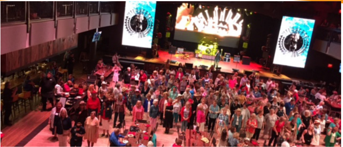
572 Delta Kappa Gamma sisters enjoyed the western buffet and line dancing at the Wildhorse Saloon during the “Call Me Country” event sponsored by the Educational Foundation to raise funds. The $40,514.00 netted during the event will go directly toward funding awards.