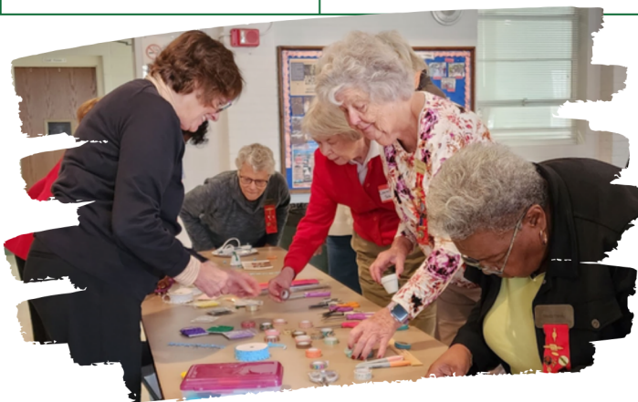
DKG members work on crafts