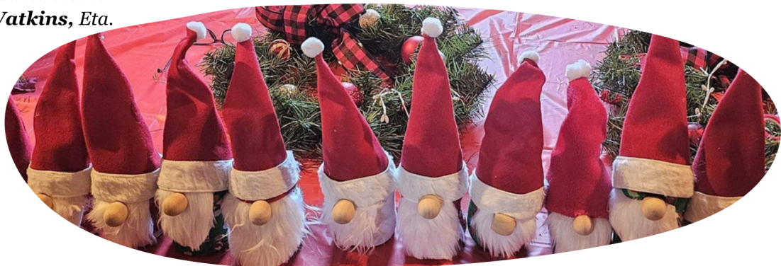
Nu's holiday gnomes made from socks