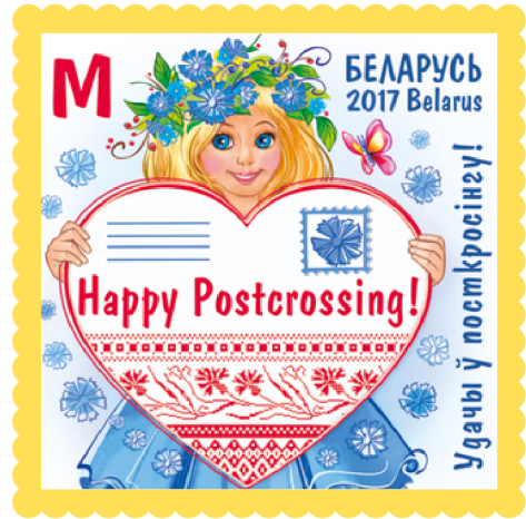
A postcrossing stamp