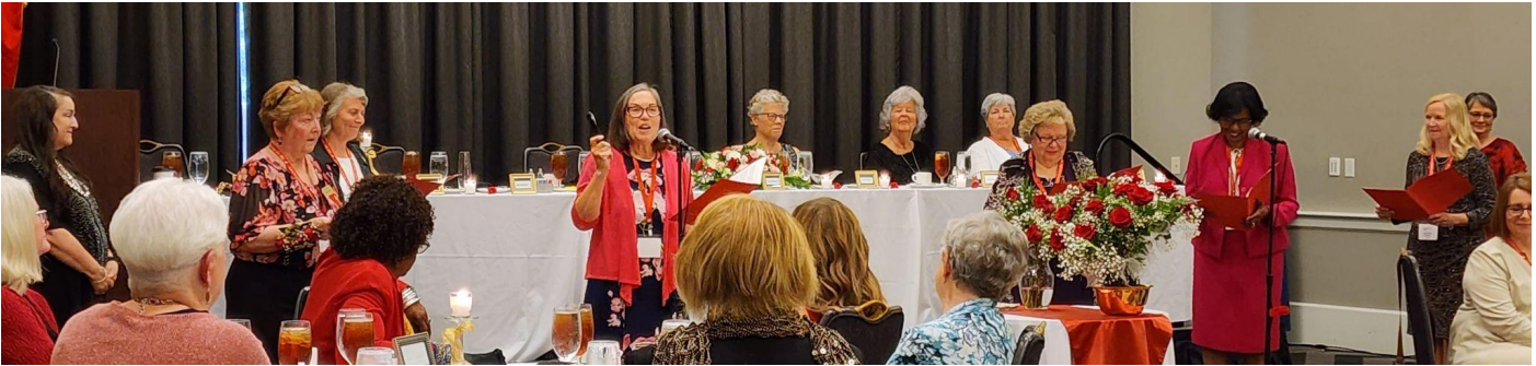
New DKG MD officers are installed during the Saturday evening banquet.