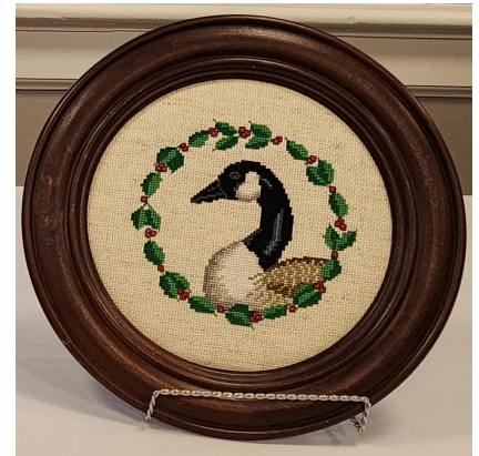
Shari Grim's creative cross stitch