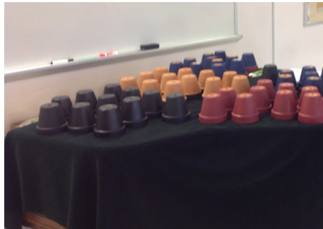
Clay pots waiting to be transformed.

Will you be an Alpha Beta State Soldier-Member and March to the Rhythm this Biennium? Alpha Beta State needs ALL of our members to share their voice, time, and energy.