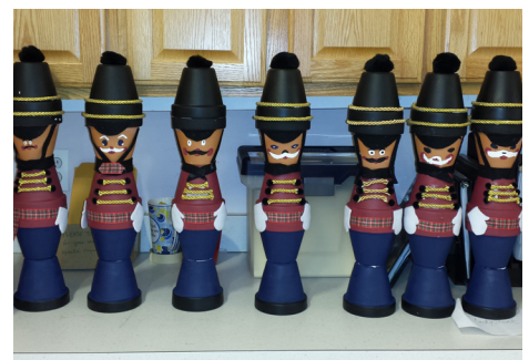
The finished soldiers come marching in!