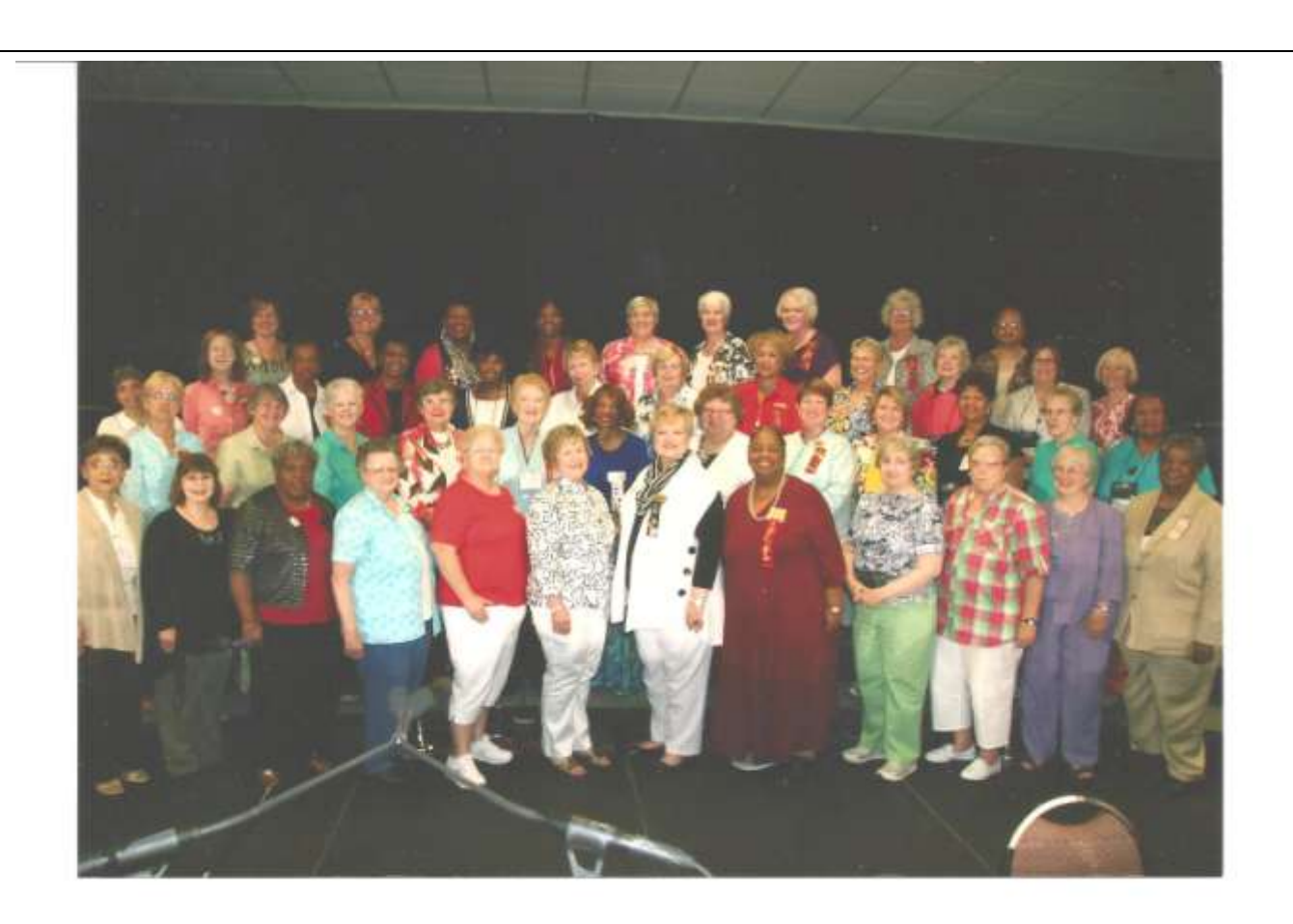
Maryland Attendees at the Northeast Regional Conference