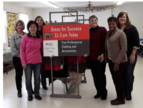
Alpha Theta Chapter organized several community events including Dress for Success which provided professional clothes for those seeking employment.

In more recent years, the chapter held several community events including organizing a Dress for Success Day to provide professional clothing for those seeking employment, sponsoring a family at Christmas with items on their wish lists, conducting a Mid-Year School Supply Event, and supporting local elementary school projects. Our current members have a variety of educational experiences including serving as directors of community non-profit organizations and managing an online educational service. Alpha Theta is continuing to seek members from private schools and include educators from other educational settings. Although our 30th anniversary celebration will take place on Zoom this year, we will have an in-person commemoration in 2022 inviting many of our former members to observe this milestone with us.