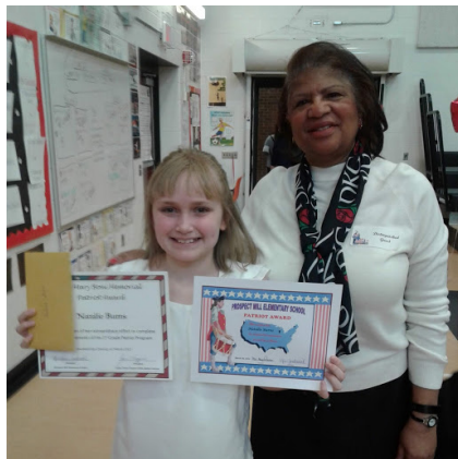
A student at Prospect Mill Elementary received the Mary Boni Patriot Award initiated by Alpha Theta.