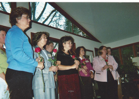
Alpha Theta induction ceremony

On April 12, 1991, 12 members from Tau Chapter formed the newest Maryland chapter, Alpha Theta from Harford County. The 12 charter members initiated nine additional new women on that date at the Maryland Golf and Country Club so Alpha Theta began with 21 key women educators as members. Currently, only one member from that original group remains a member of the organization, and she is an honorary member. Like many chapters, Alpha Theta has seen its share of membership fluctuations. At one time, we had 53 members. Many were public school educators and included a large number of administrators. Sadly, our membership has dwindled. However, we have a goal to rebuild our membership numbers.