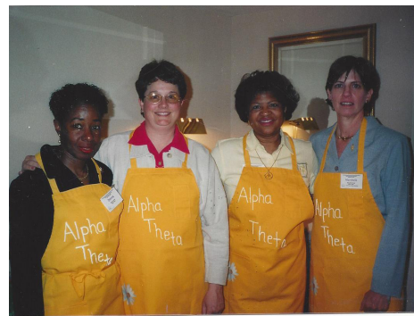
Alpha Theta created special aprons for the Hospitality Room at the 2003 Maryland State Convention.

During the 2003 State Convention, Alpha Theta was given the responsibility of the Hospitality Room. The chapter decided to step up its game and created special aprons to wear in the hospitality room. The aprons were a hit along with the delicious snacks we served in that gathering area.