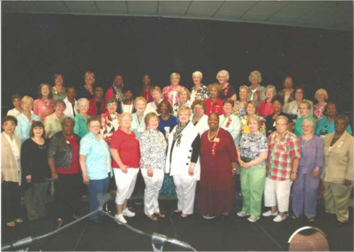
Maryland Attendees at the Northeast Regional Conference